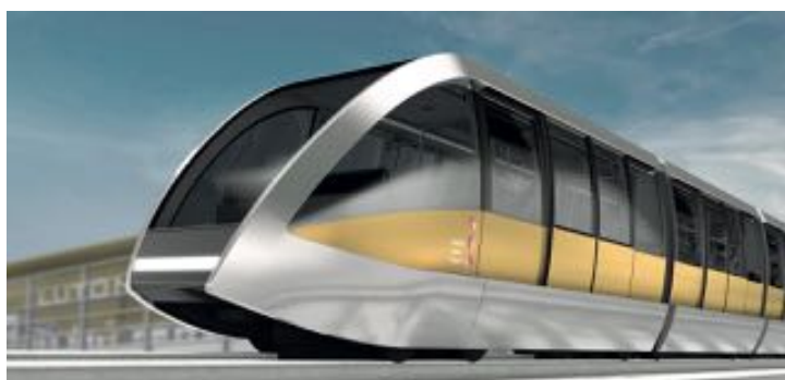
Above. The Dart rail link train.

Meanwhile, he added, a new three-minute rail link costing £225 million, connecting Thameslink's Luton Parkway station to the airport terminal was under construction. It was designed to encourage more passengers to arrive and leave by rail rather than by car. The airport was liaising with Thameslink to improve capacity of trains serving Parkway station.