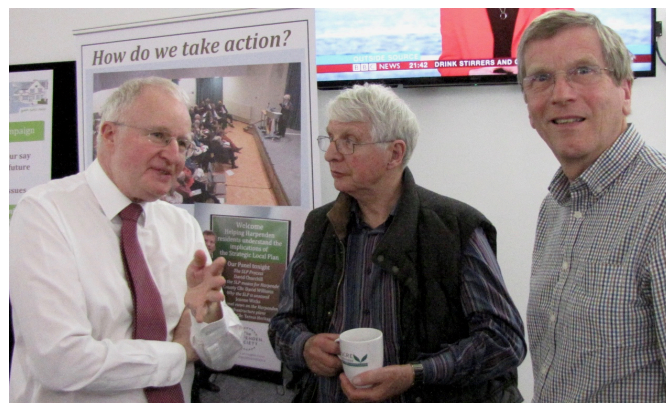
Below: Visitors examine the Health Centre plans