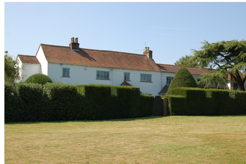
Kinsbourne Green House