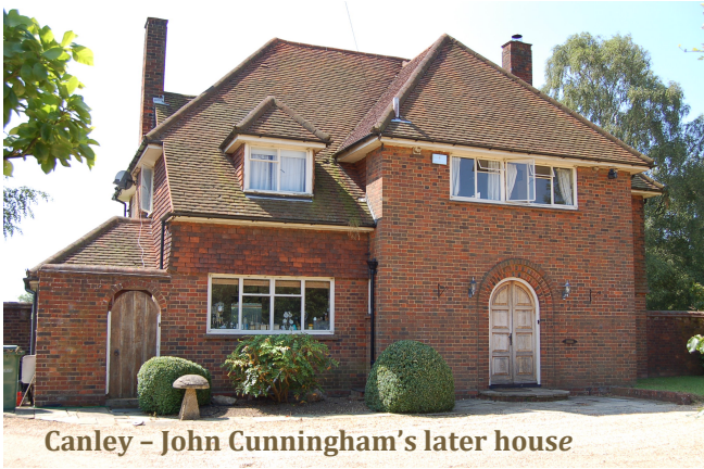
Canley – John Cunningham's later house

One of Harpenden's most distinguished and officially honoured residents was John Cunningham, (right) whose service as a night-time fighter pilot during the Second World War earned him his famous nickname 'Cat's Eyes'. A life-long bachelor, he lived for most of his later life, up until his death aged 84 in 2002, at 'Canley', the house facing Kinsbourne Green Common which still bears the same name.